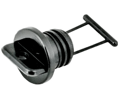
BU62 - 16mm