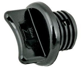
BU42 - 18mm