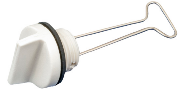
BU52W - 19mm fine thread