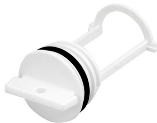
BU37 - 31mm