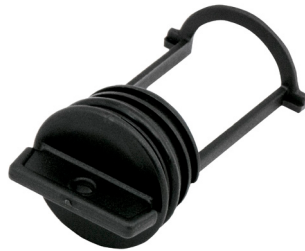
BU32 - 31mm