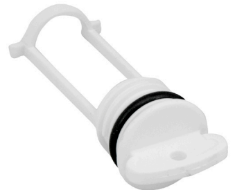
BU307 - 21mm