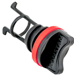
BU295 - 16mm