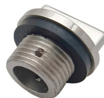
BU29 - 19mm Stainless Steel