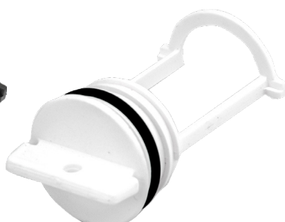
BU397 - 40mm