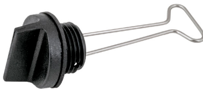
BU52 - 19mm fine thread