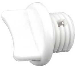
BU47 - 18mm