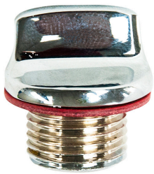
BU27 - 19mm Chrome

To help you recognise and order the correct bung, the available replacement ones are shown below with their A dimension.