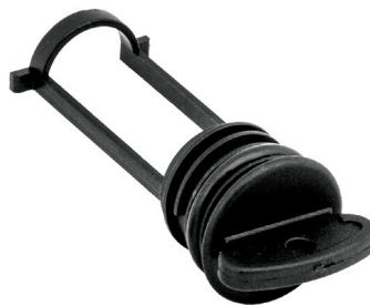
BU302 - 21mm